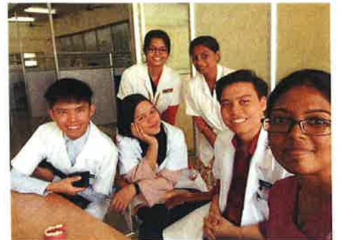
After a round of discussion on cavity preparation techniques