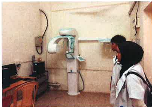
A DPT machine, installed in their radiology department