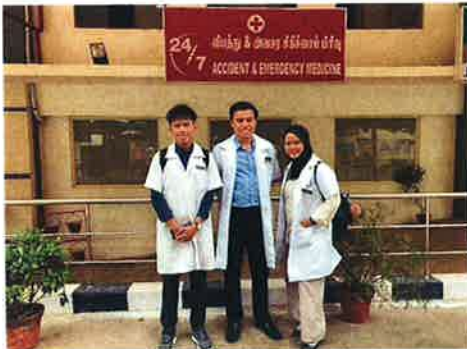
Photo opportunity after visiting their hospital