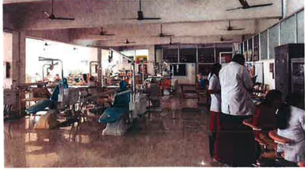
Typical layout of their clinics