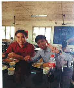
Enjoying a typical Tamil breakfast of idly and vada with a cup of filter coffee